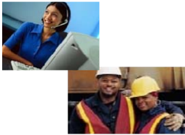
Top 30 U.S. States & Territories, by Total Workers Certified

"INNOVATION DISTINGUISHES BETWEEN A LEADER AND A FOLLOWER" - STEVE JOBS