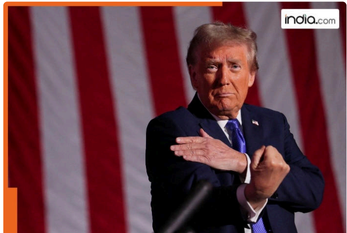
Donald Trump at the rally in Latrobe, Pennsylvania where he shared a story about golfer Arnold Palmer's naked body.

US Presidential Election Results 2024: Republican Donald Trump has defeated Vice President Kamala Harris, recapturing the White House. With crucial projections from Alaska and Wisconsin, Donald Trump now has 279 electoral votes, while Kamala Harris stands at 223. Trump, who is likely to be the incoming President of the United States of America (USA), is expected to end automatic citizenship for children. The plan is to sign an executive order to this effect on Day 1 itself. This has been posted on the official Trump-Vance campaign site,